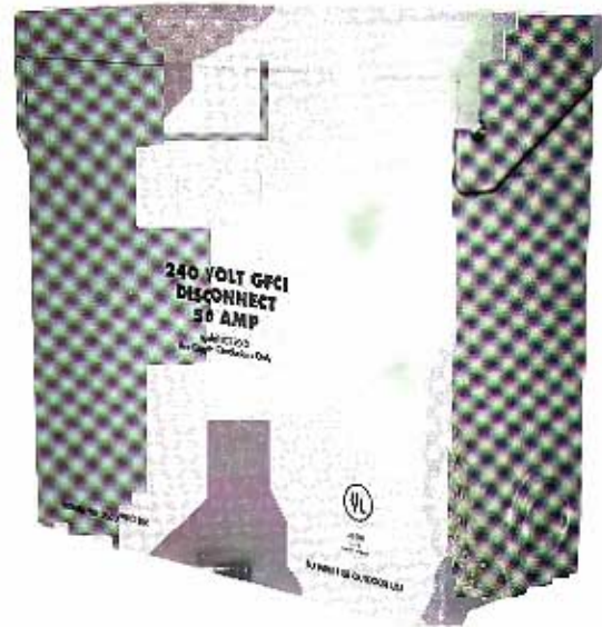
MODEL LC220-D 50 AMP

• Self contained "2 in 1" unit solves space and compatibility issues.