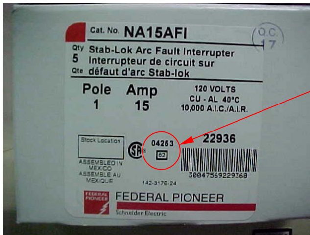
Carton Date Code (5 digit – year/week/day)