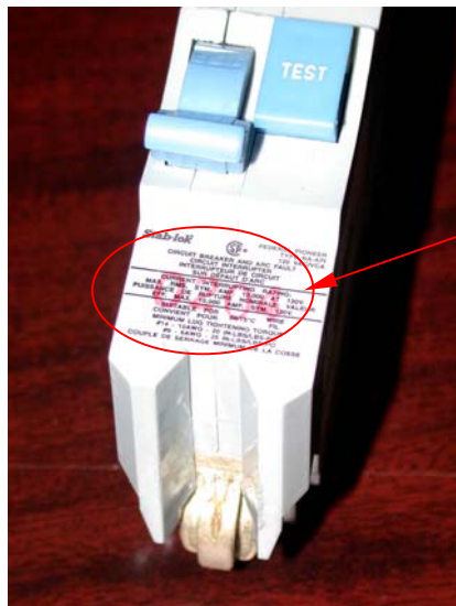
Breaker Date Code (4 digit – year/week)